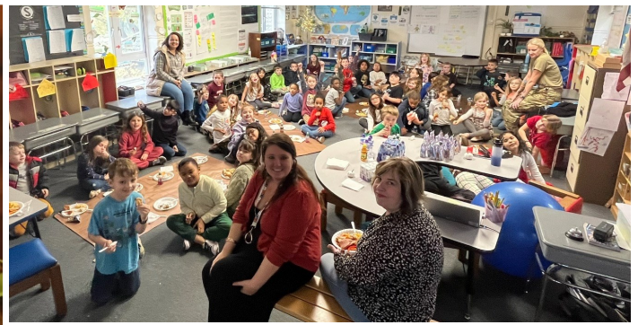
Second grade teachers, students, and some parents got together to celebrate Thanksgiving in their classrooms on November, 22, 2023.